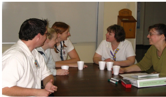
Weekly support meetings are held with the CSN or CNE